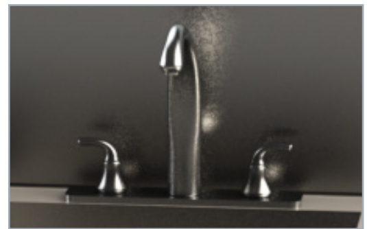
Standard Pegler Mixer Taps