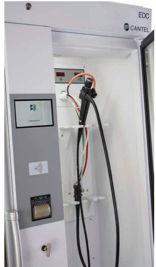
Ease of endoscope placement