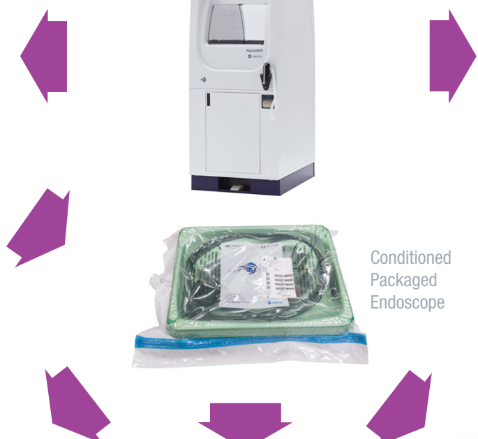
Conditioned Packaged Endoscope